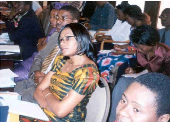
Listening to the official opening remarks