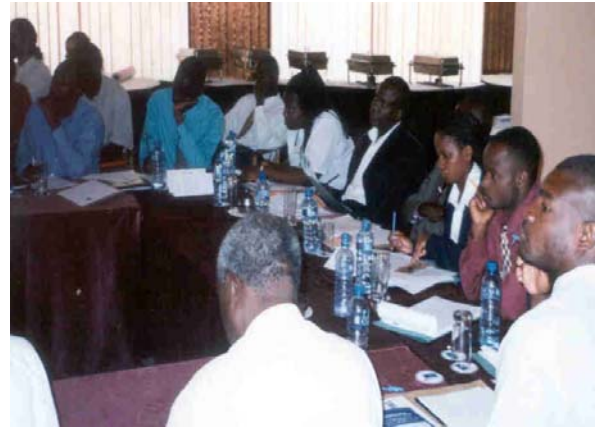
Audience during question & answer session