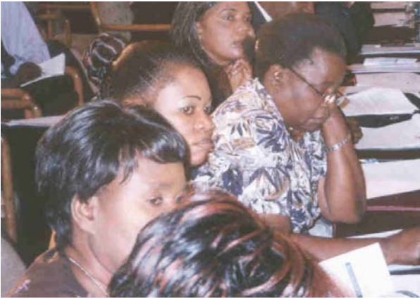
Members of the audience during a presentation